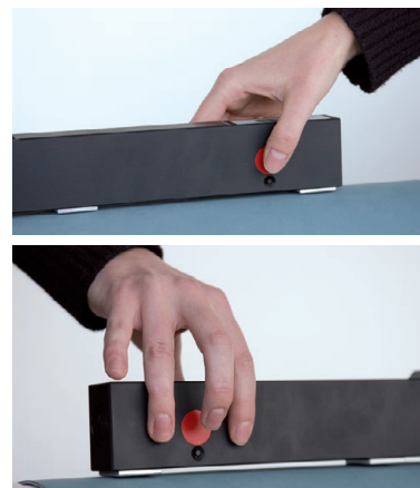
Red Dot = Contact pressure compensation point Operating Position = Position for compensating the contact pressure, i.e. the contact pressure here has the lowest effect on the measured value