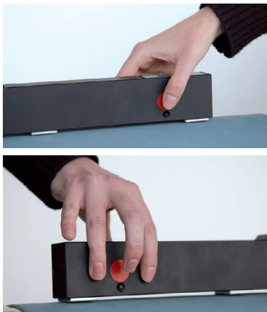
Red Dot = Contact pressure compensation point Operating Position = Position for compensating the contact pressure, i.e. the contact pressure here has the lowest effect on the measured value